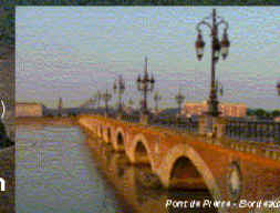
Pont de Pierre - Bordeaux